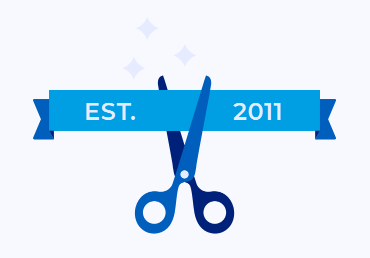
Established in 2011