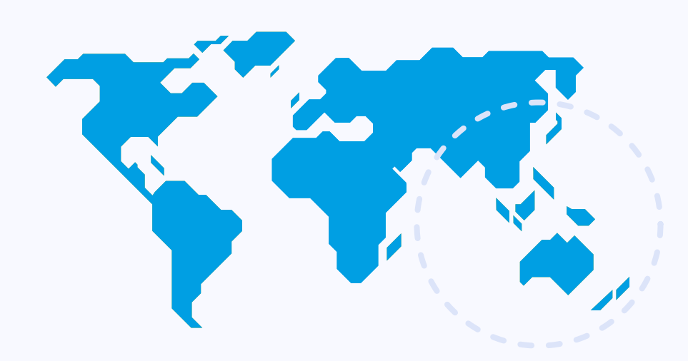
A regional research hub in Asia Pacific that connects to the world-class Asian scientific and medical networks